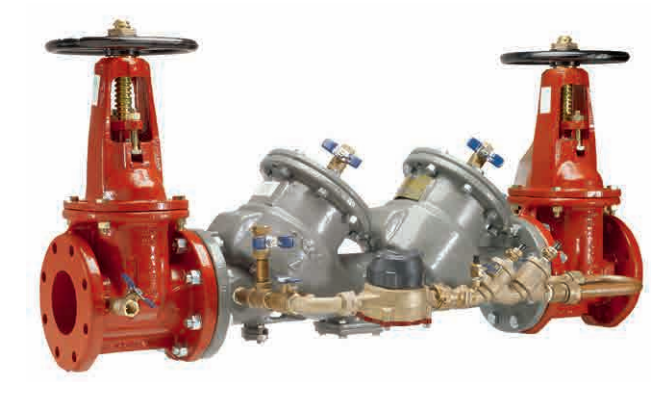
Model 856ST Double Check Detector Assembly

The FEBCO MasterSeries 856ST Double Check Detector Assemblies are designed to protect drinking water supplies from dangerous cross-connections in accordance with national plumbing codes and water authority requirements for non-health hazard non-potable service applications such as irrigation, fire line, or industrial processing. This Backflow Assembly is primarily used for protection of drinking water systems and fire sprinkler systems, where Local Governing Code mandates protection from non-potable quality water being pumped or siphoned back into the potable water system.