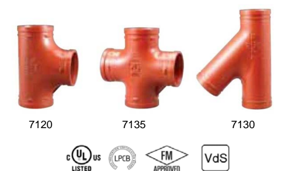
For Fire Protection pressure rating, listing, and approval information, refer to Data Sheet B-42 or visit SHURJOINT website, www.shurjoint.com for details or contact your SHURJOINT Representative.

Shurjoint standard fitting pressure ratings conform to the ratings of Model 7707 couplings.